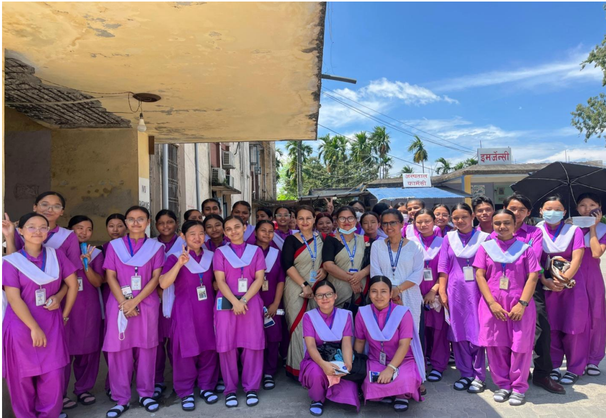
Fig: With Nursing Incharge after visit of Mechi Provincial Hospital