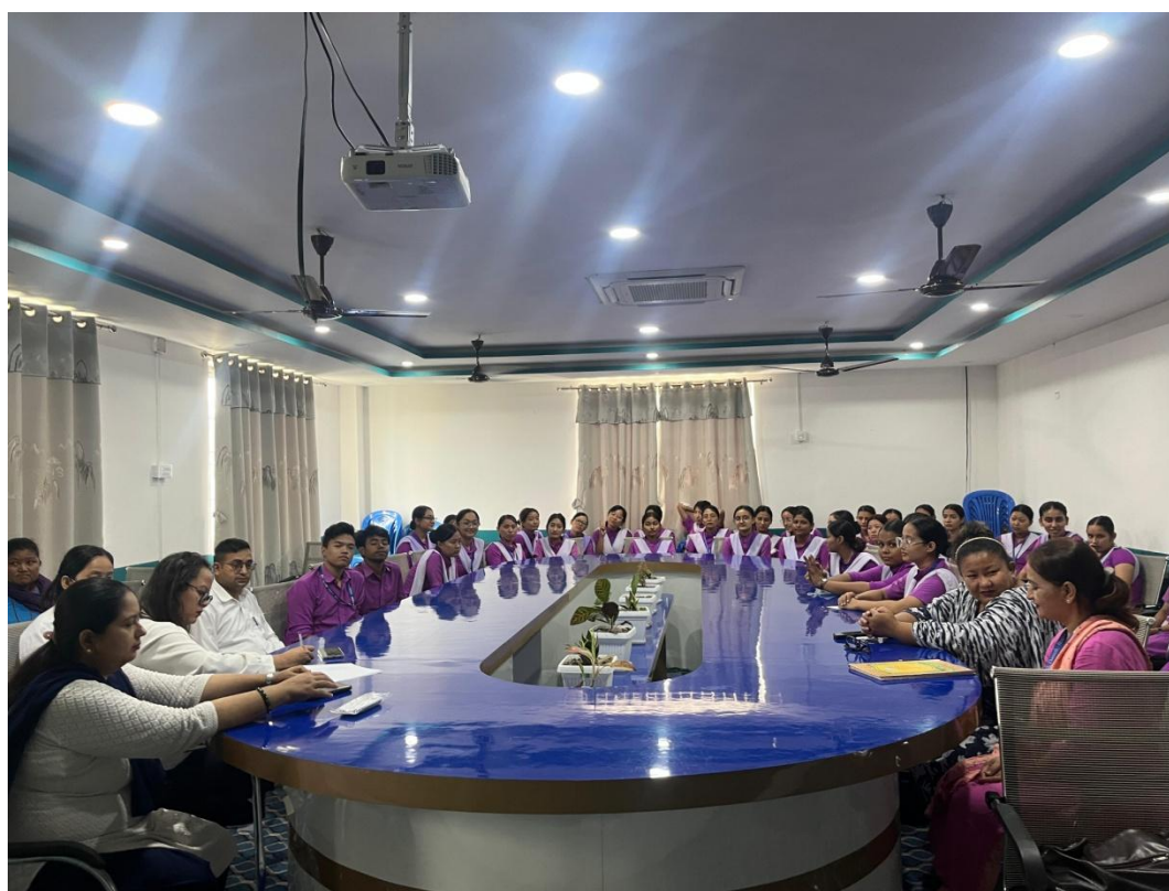
Fig: with Respected Hospital Matron maam and admin staffs