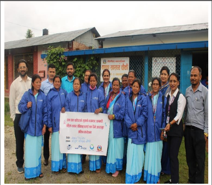
FCHV Training at Baluwa Health Post