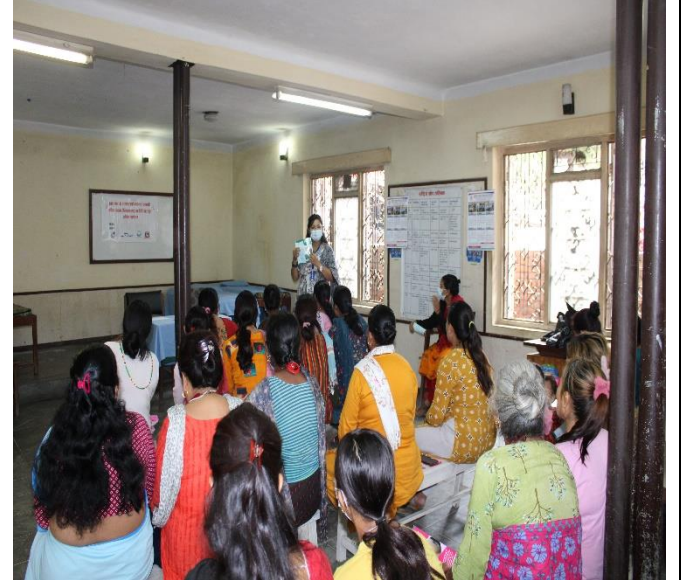
Educational Activities at Gramin Education Swastha service center, Ward -7