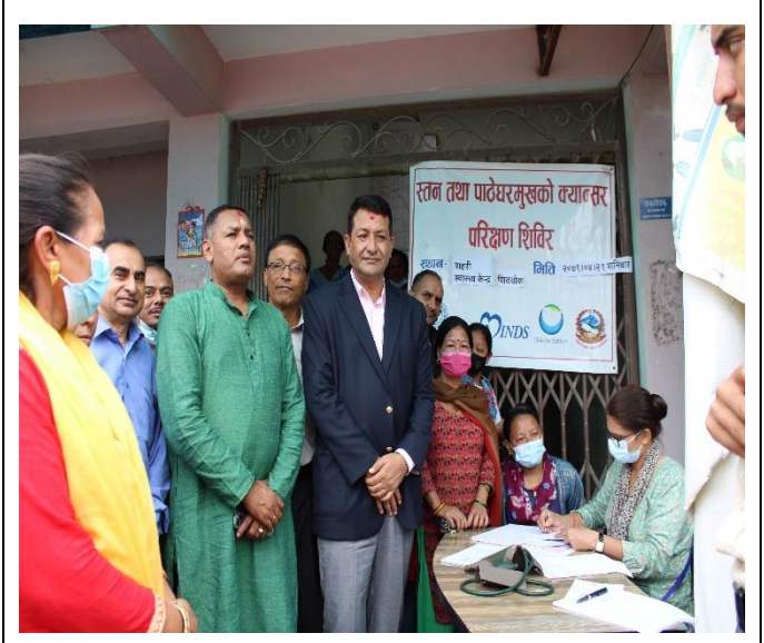
Supervision Visit by Mayor & Ward President at Shivachock Urban Clinic