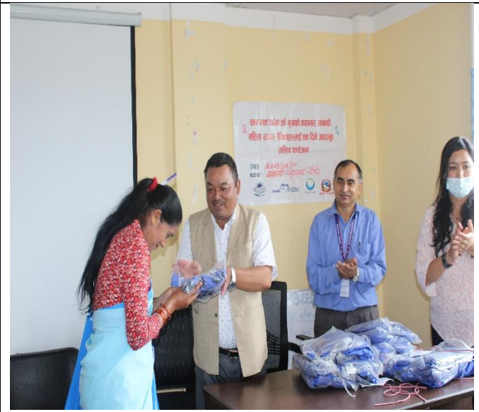
Jacket Distribution Nayapati Health Post during FCHV training.