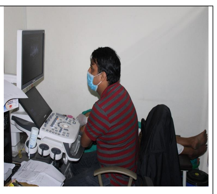
USG Screening at AMDA Clinic