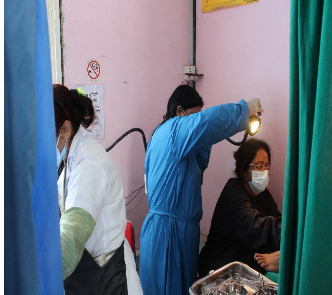
Cervical Cancer Screening at Gokarneshwor Nagar Hospital, Ward 4