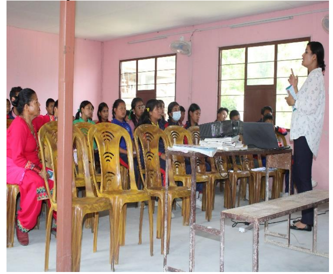
School Health Program at Devi Bal Sudhar Secondary School, Ward 3.