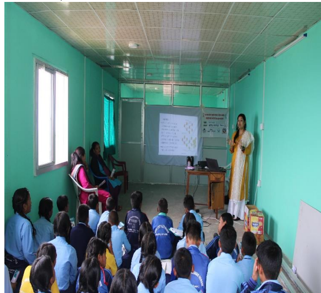
School Health Program at Tarveer Basic School, Tareveer, Ward 3.