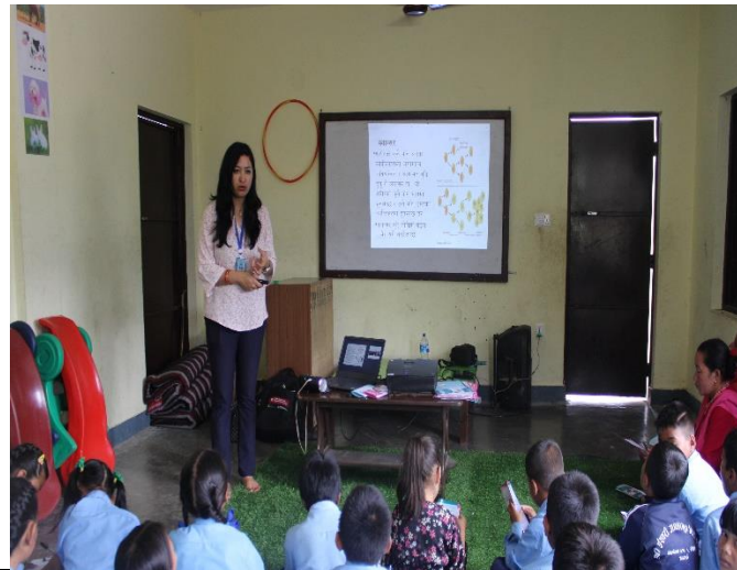
School Health Program at Iswori Basic School, Okhareni, Sundarijal.