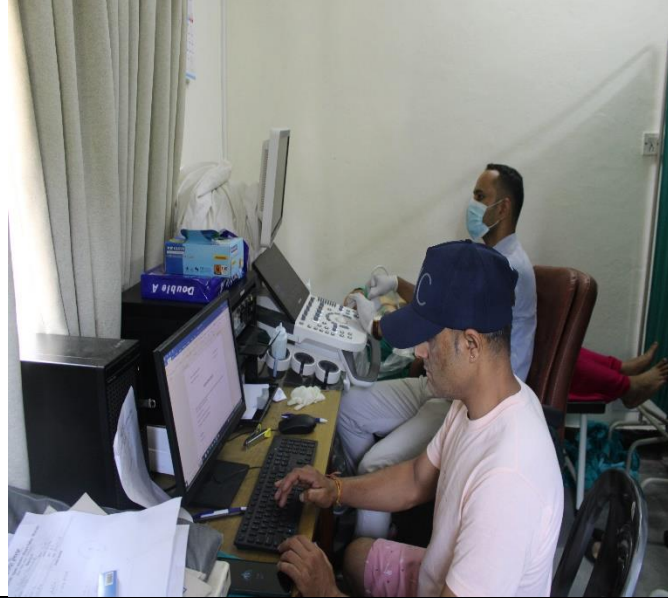
USG Diagnostic Screening Camp at at AMDA Clinic.