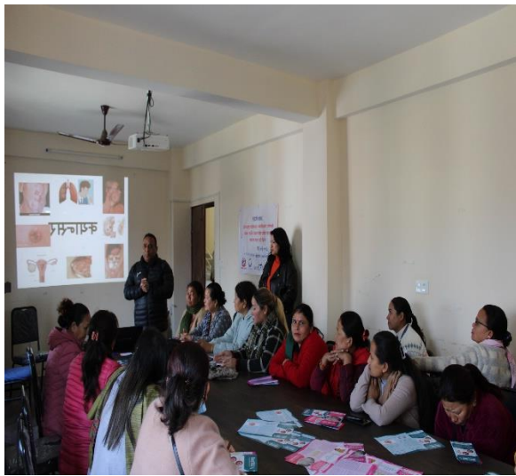
Awareness Program among president of different samuha at Ward 8.