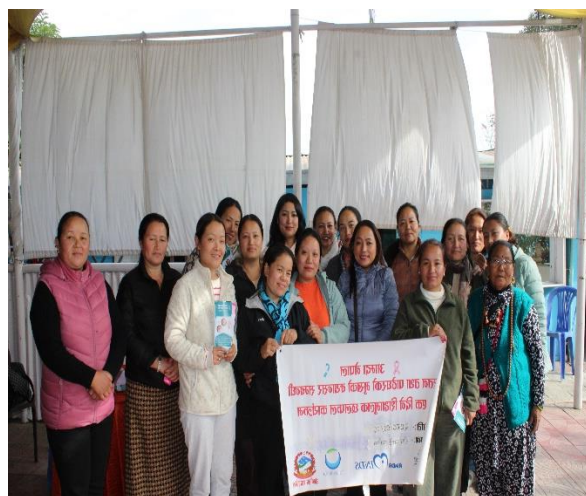
Educational activity among Srijansil Mahila Samuha ,Ward 6