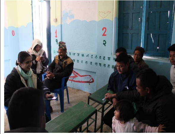
Focused Group Discussion at Okareni among Men Group