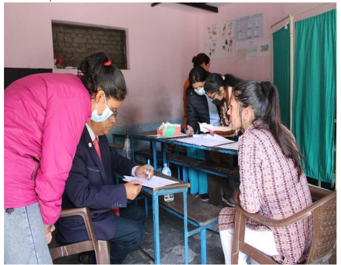
Screening Camp at Pacha Pokhari Secondary School, Ward 8.