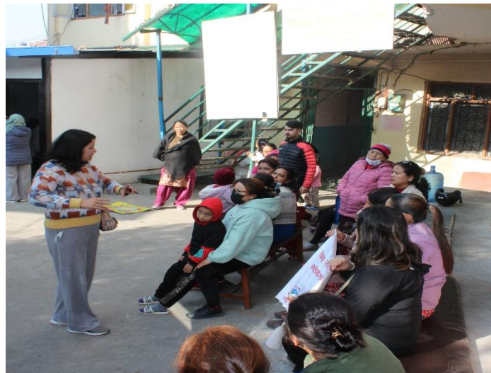
Educational activity among local women's group at Ward 5.