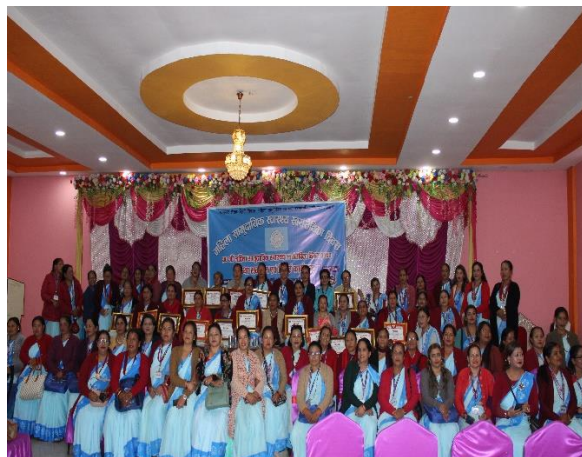
FCHV Day celebration