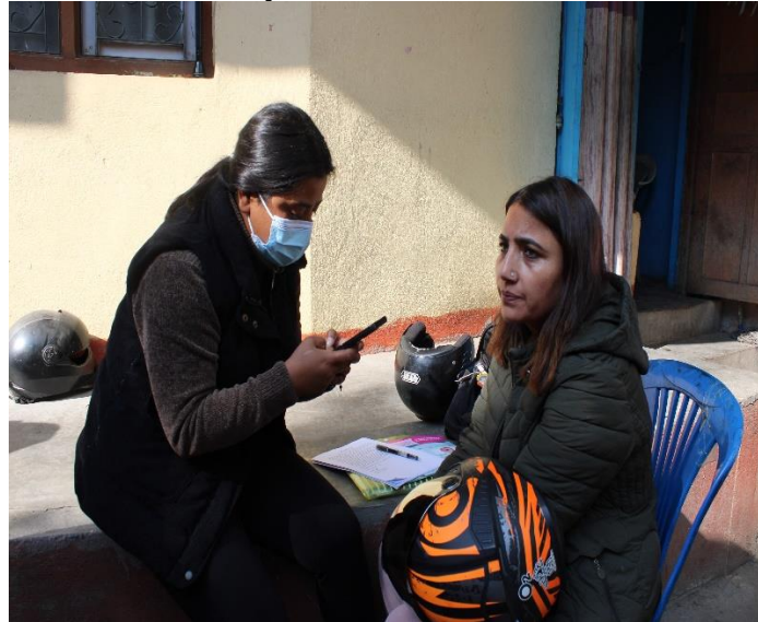
Data Collection by enumerator