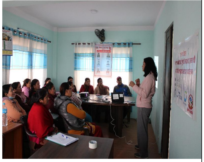
Awareness Program among president of different samuha at Ward 7.