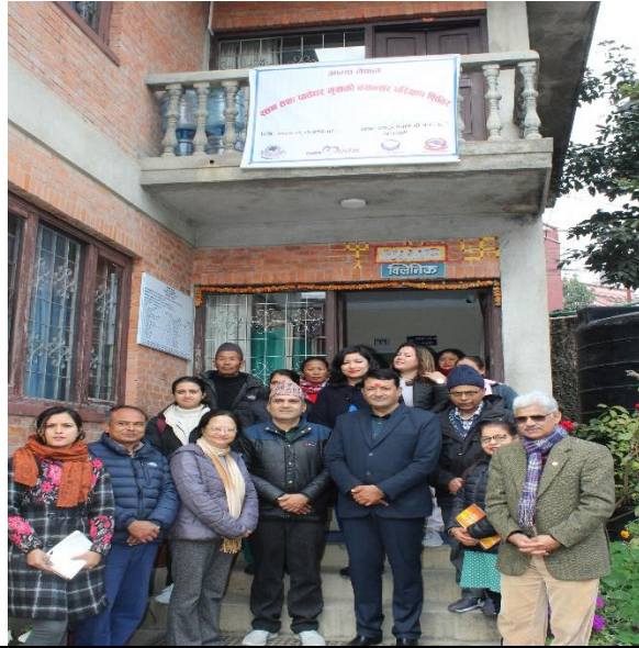
Screening Camp at AMDA Clinic.