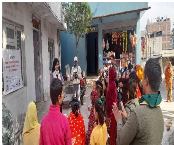
Educational activity among women's group of pani puri factory, Ward 5