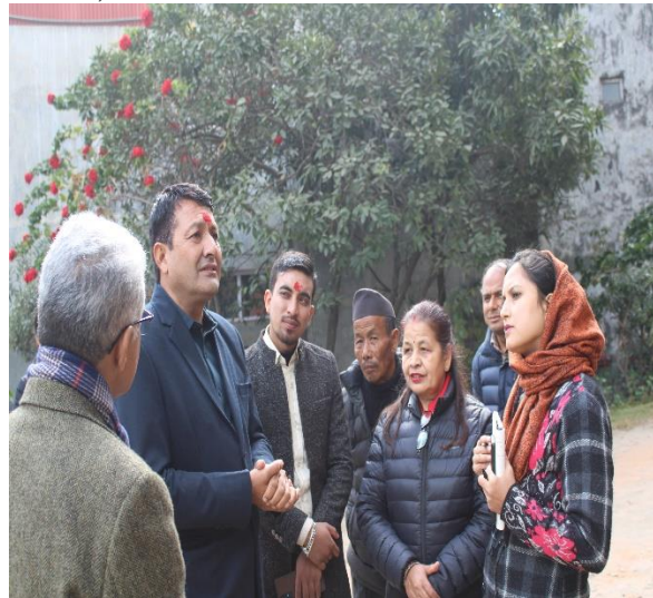
Social Welfare Council Visit at AMDA Clinic, Ward 6.