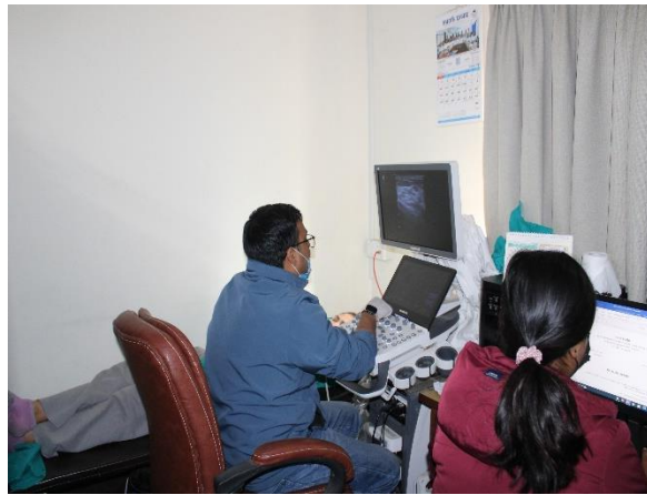
USG Diagnostic Screening Camp at AMDA Clinic.