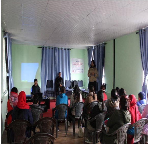
Awareness Program among president of different samuha at Ward 6.