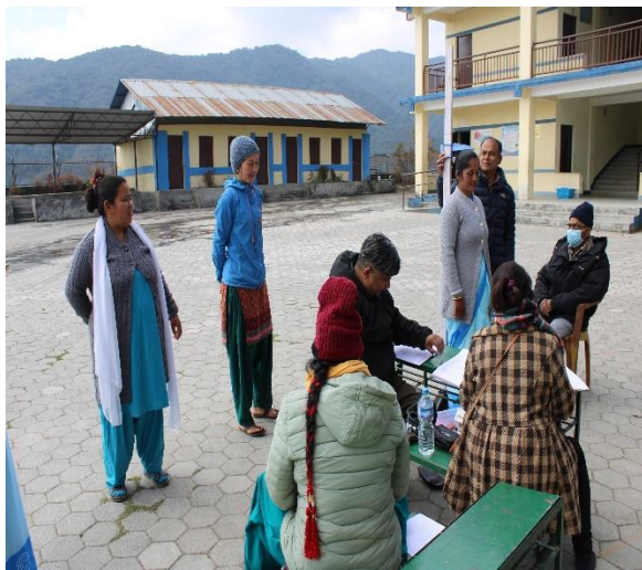
Screening Camp at Okhareni Basic School, Ward 1.