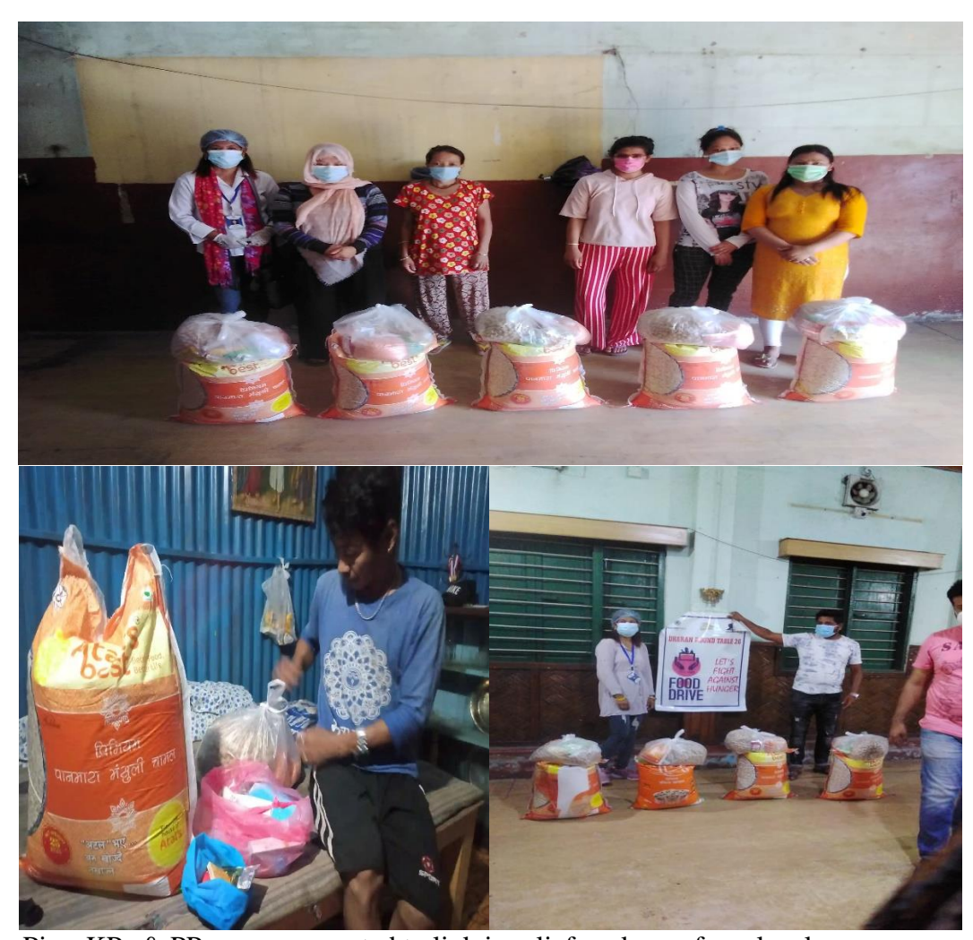
Pics: KPs & PPs were supported to link in relief packages from local governance.