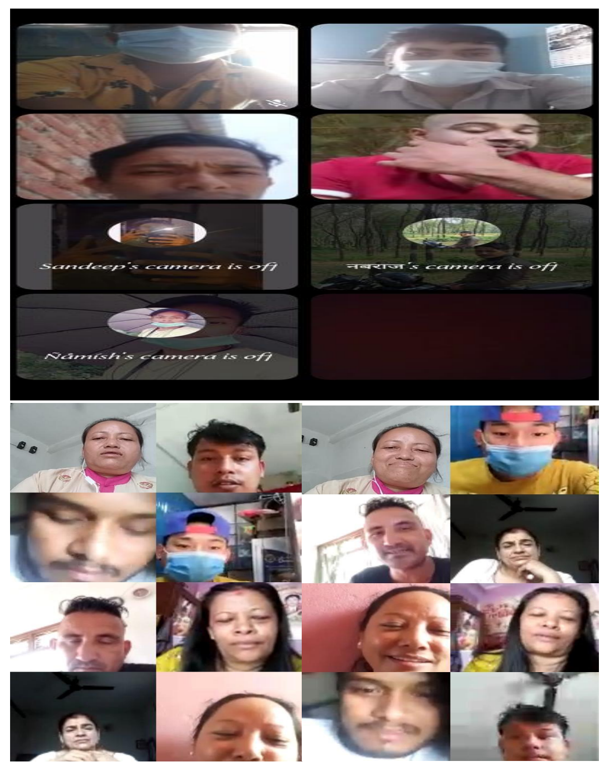
Pics: Virtual Support Group Meeting in Jhapa and Sunsari on COVID-19