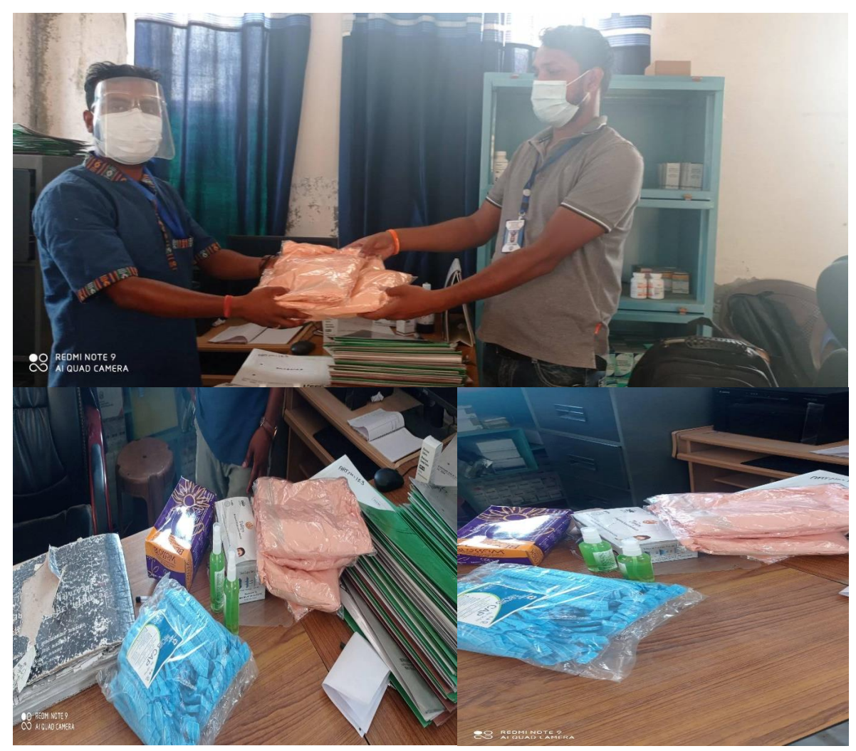
Pics: ART centers supported with PPE set by EpiC Project.