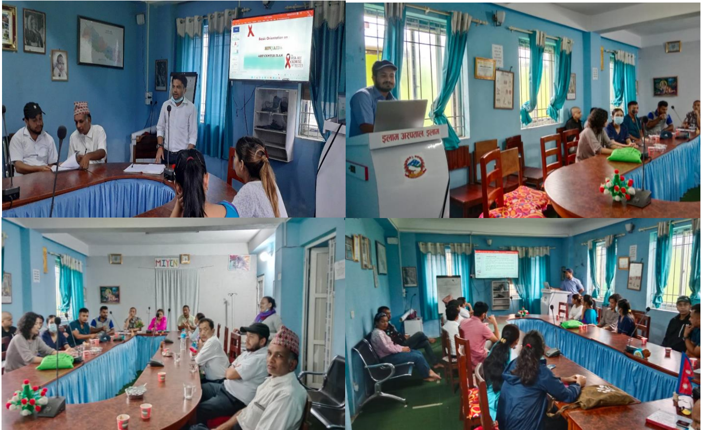
Pics: Stigma & Discrimination Orientation to Health workers of Ilam Hospital and CBOs.