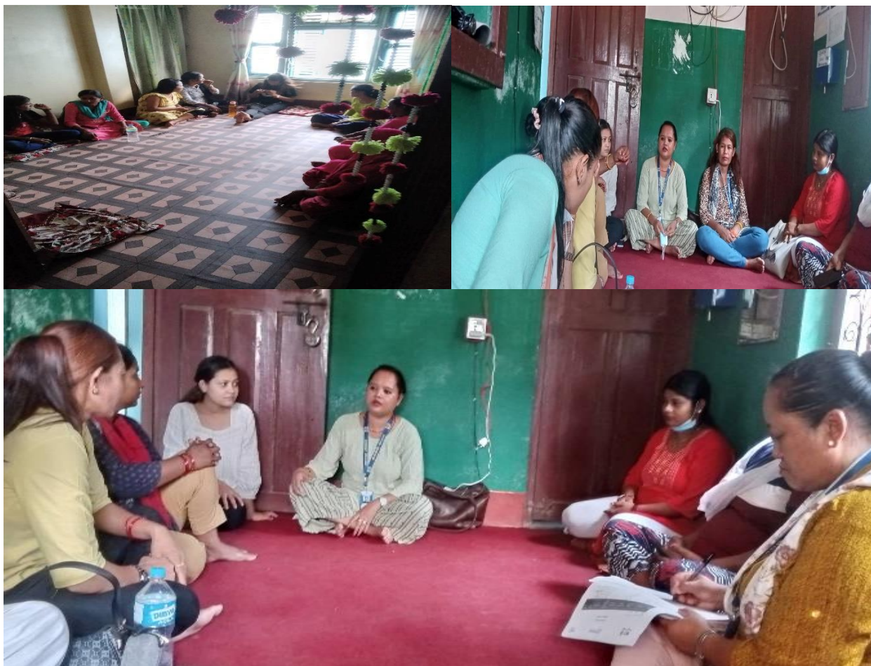
Pics: Creative event meeting at Itahari City Clinic & Brt. Field Office.