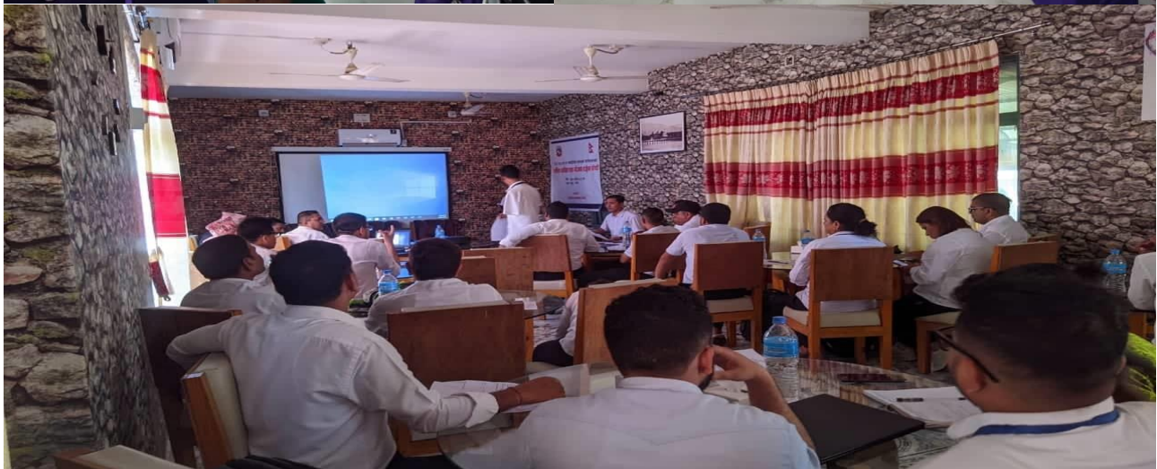
Pics: Participated in Annual Health Review Meeting.