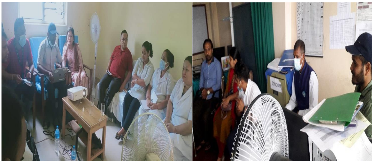
Pics: Monthly ART meeting at BPKIHS and Ilam ART Center.