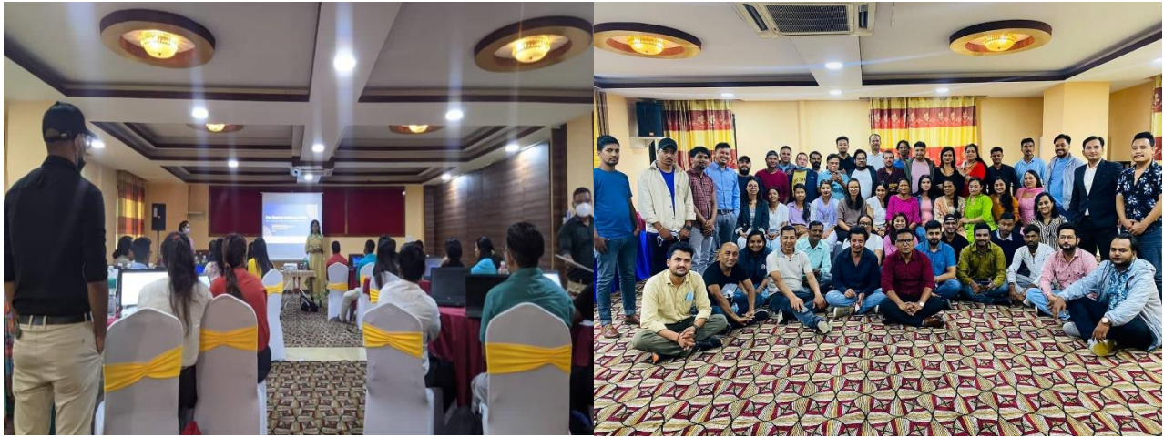
Pics: Participated in the training organized by fhi360