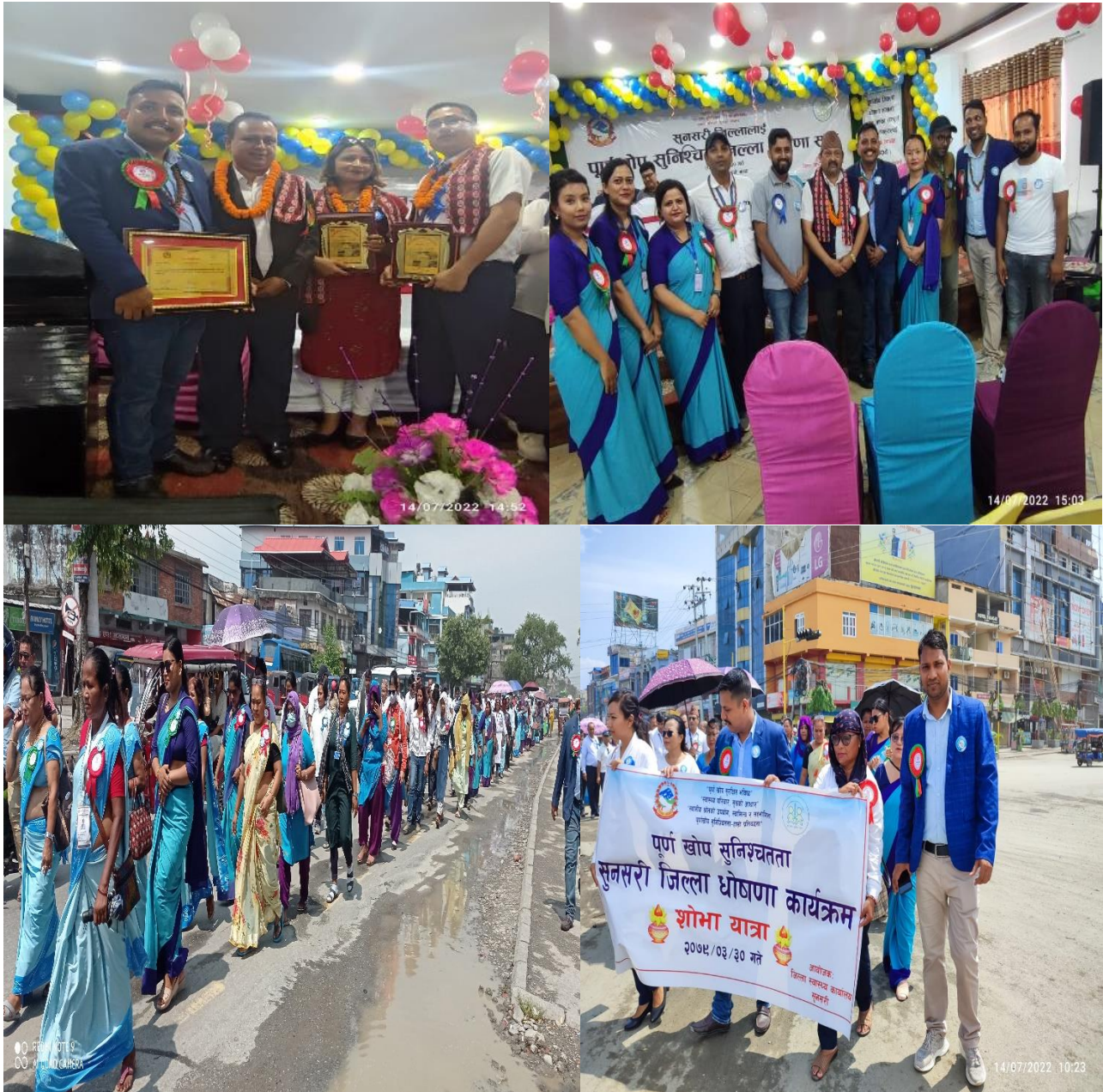
Pics: Some clicks of declaration of full Immunized district Program Sunsari.