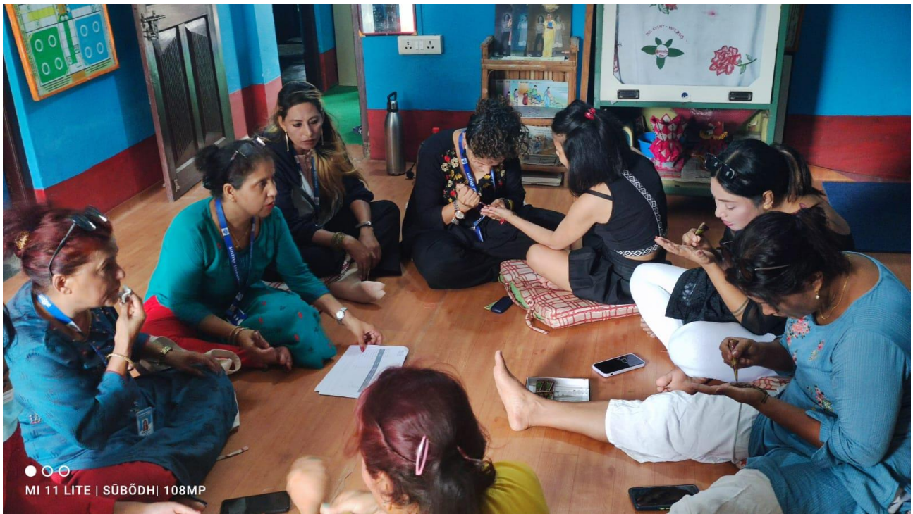
Pic: Creative event “Shrawan bises” at Birtamode City clinic