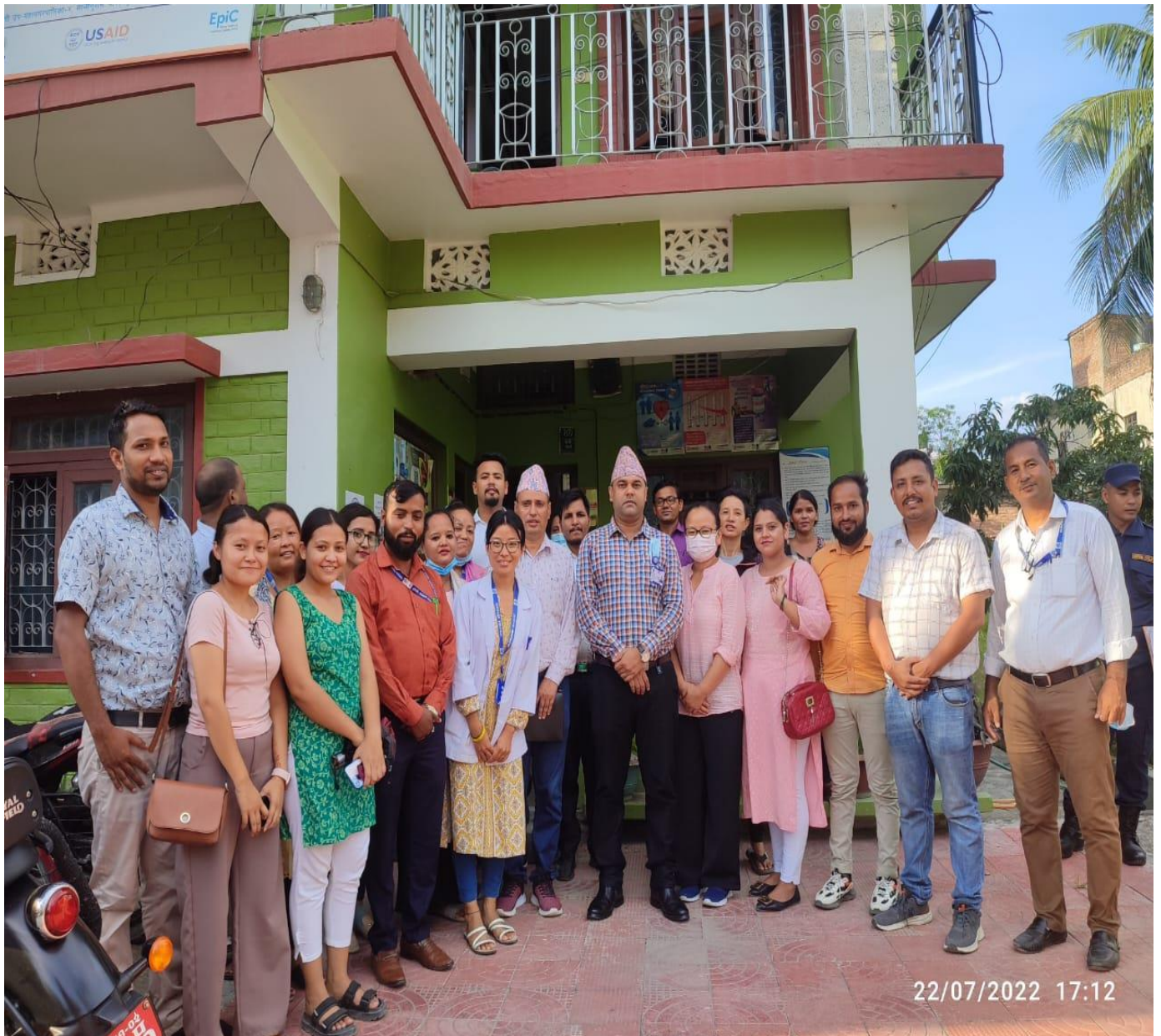
Pics with Chief and Deputy chief District Officer along with other stakeholders in Itahari City Clinic.