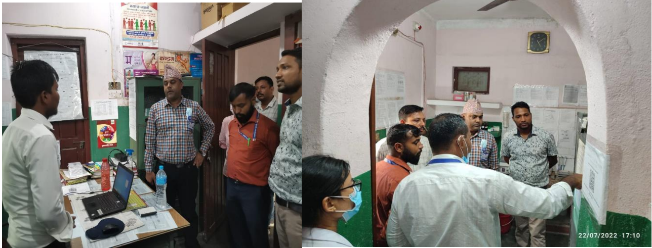
Pic: Sharing meeting and Monitoring visit from Local governance and stakeholders at Itahari City Clinic, Sunsari