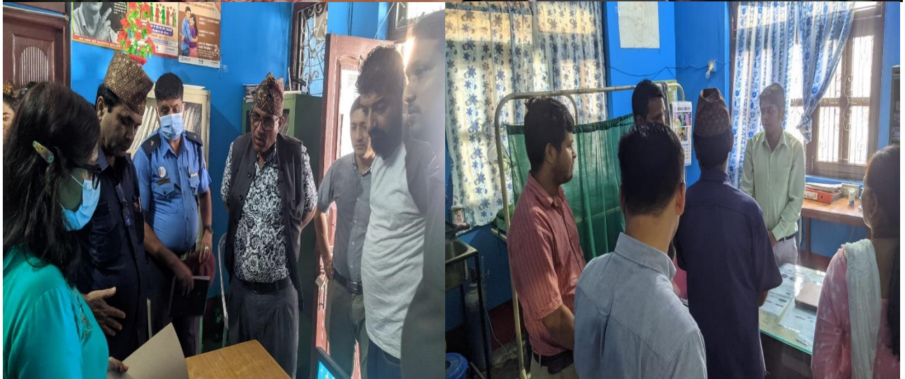
Pic: Sharing meeting and Monitoring visit from Local governance and stakeholders at Birtamode city clinic