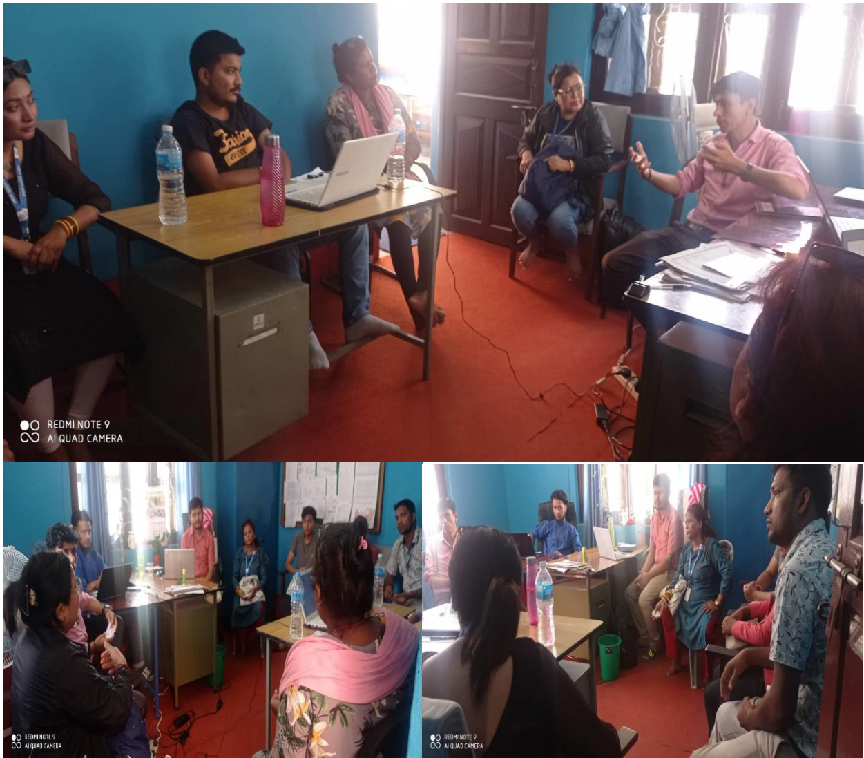
Pics: Coordination meeting with JMMS, Lead Nepal, WOREC Nepal, Jagaran Mahila Samaj and AMDA Nepal at Birtamod City Clinic.