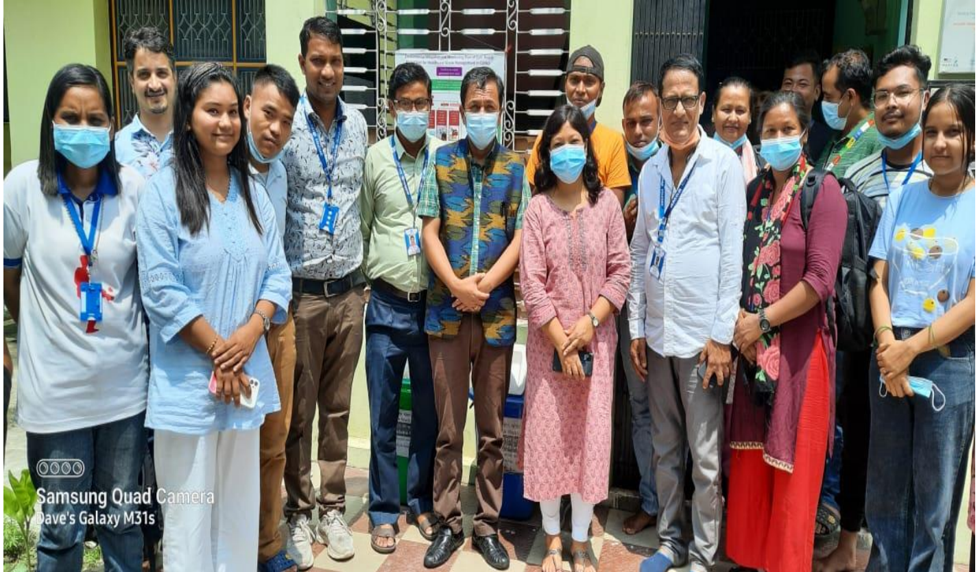
Pics: AMDA Nepal and PPS Morang Team with FHI360 Country Director and Provincial Coordinator.