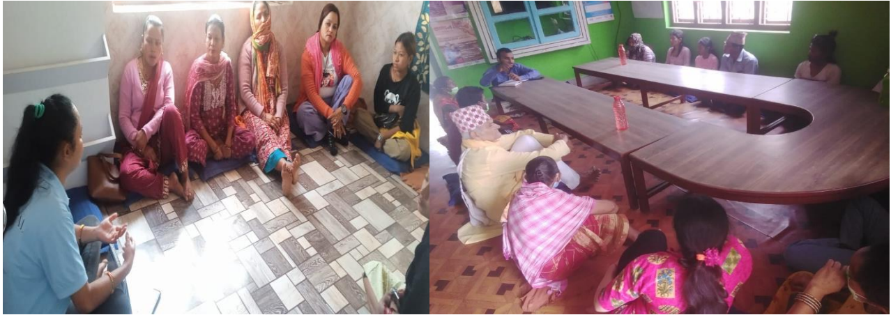
Pics: Monthly creative event and support Group Meeting