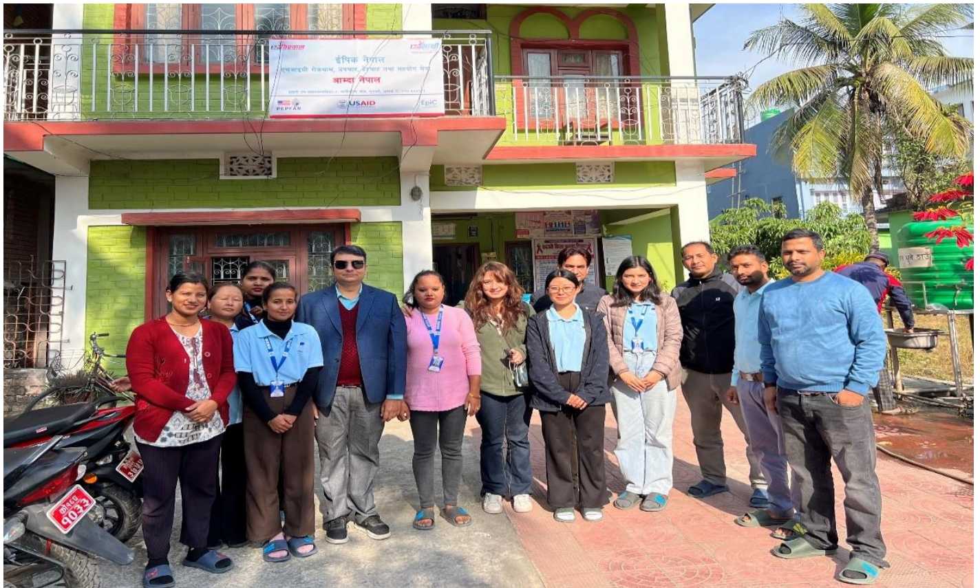
Fig. Monitoring visit from FHI360 at Itahari city clinic