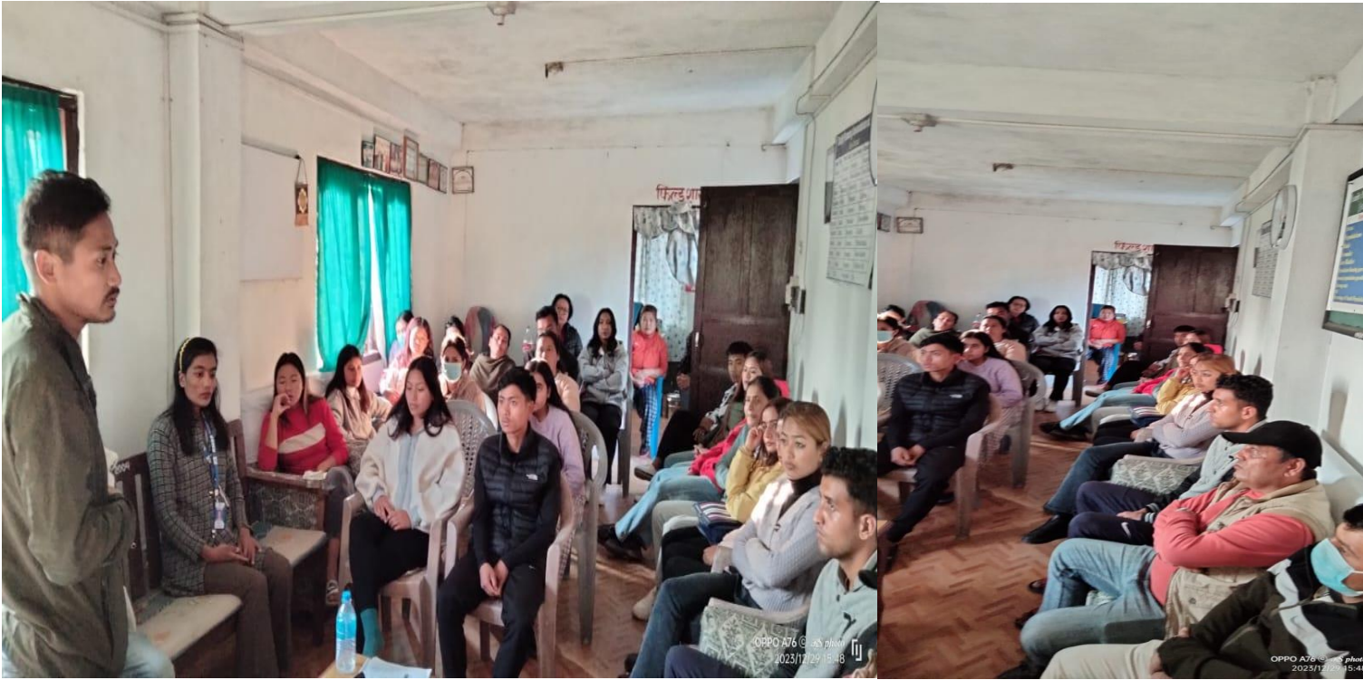
Pics: S&D reduction training conducting to Health workers and different Club members.