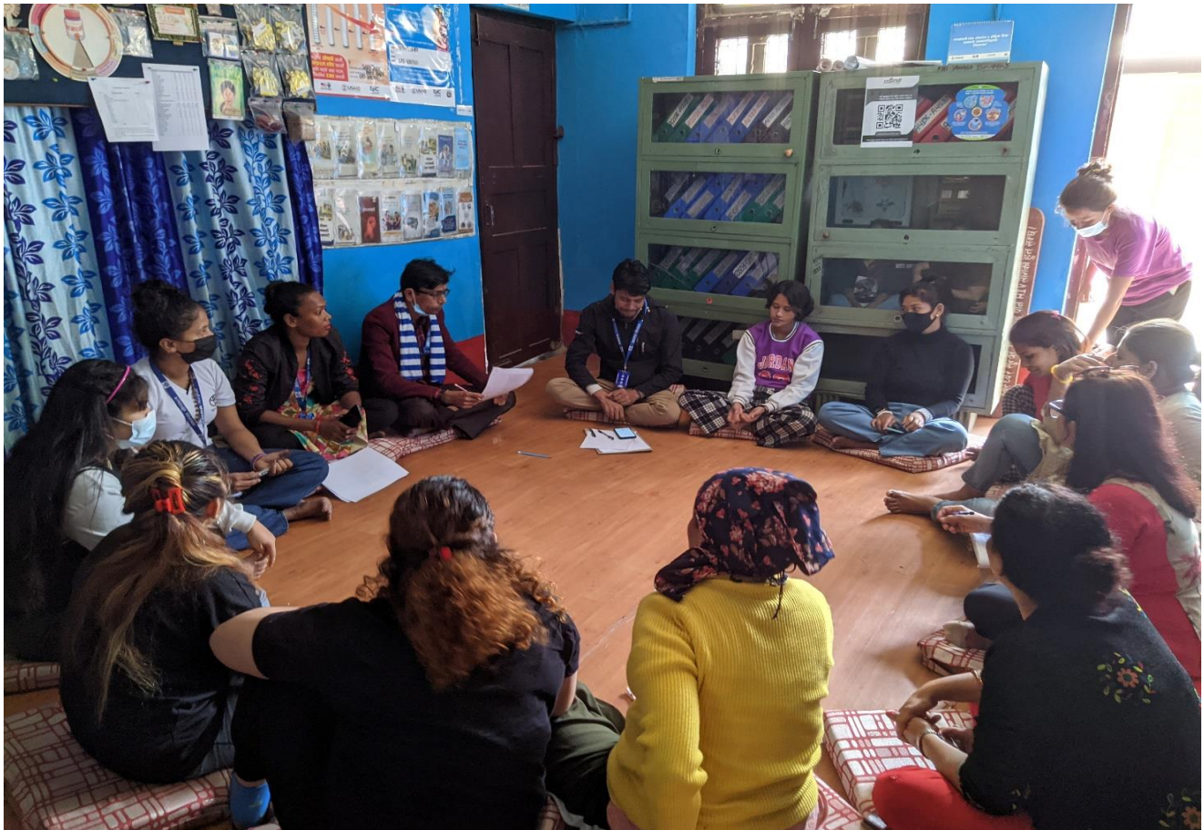
Pic: Creative event at Birtamode City clinic