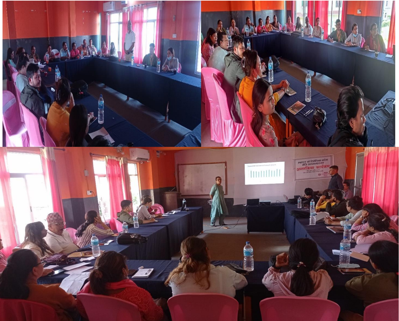
Pic: PMTCT services recording and reporting orientation organized by PHD.