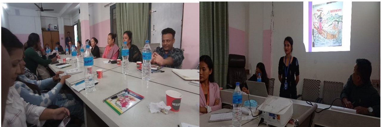
Pics: Participation in coordination and sharing meeting of Jagaran Aarogya Kendra at Itahari.