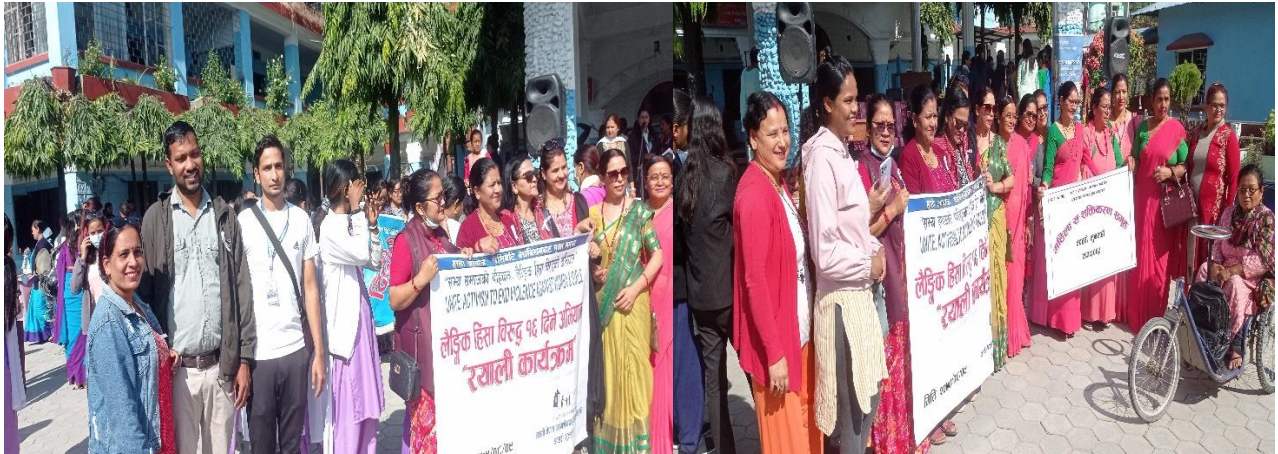
Participated in the Opening Ceremony of “16 Days Campaign Violence Against Women” organized by Itahari Municipality.