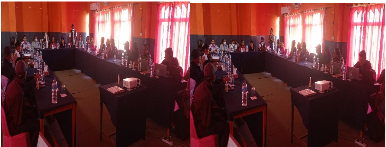
Pics: Coordination and sharing meeting organized by EpiC Project in Itahari, Sunsari.