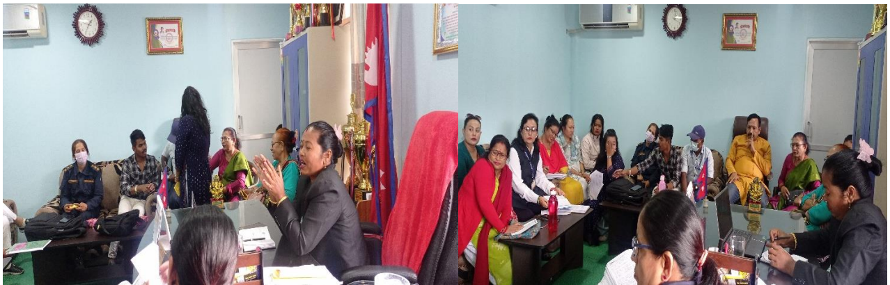
Participated in the planning meeting of “16 Day Campaign of Violence Against Women” organized by Itahari Municipality.