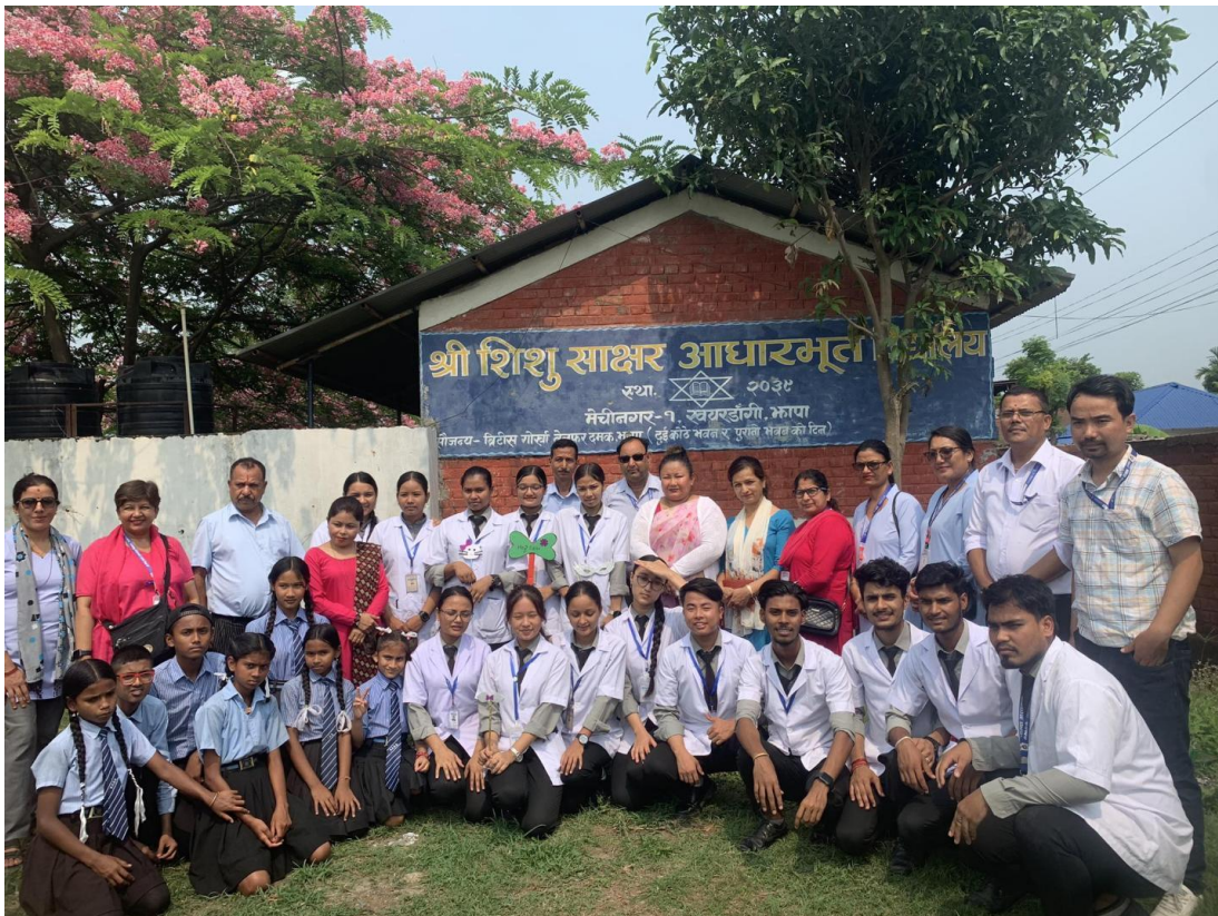
Image 6 : AIHS staffs, teachers and students of Shree Sishu Sakshar Adharbhut Vidyalaya and GM 3 rd year students