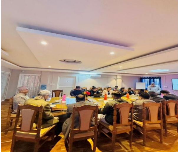
PCL nursing 1st year Community Grand Presentation In the presence of Damak Chair man Word no 1 and School Principal of Shree Bhrikuti Secondary School