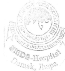
डा. नविन ढकाल मेडिकल सुपरिन्टेन्डेन्ट