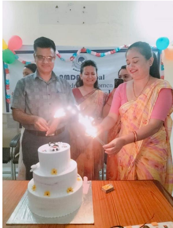
Cake cutting ceremony