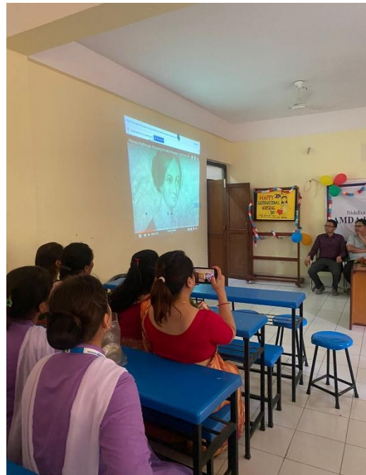
Presenting speech and documentary