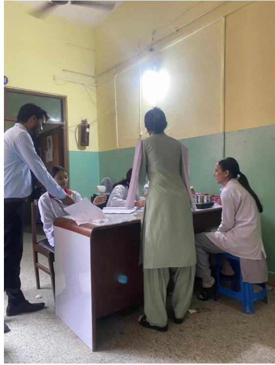
Pen and chocolate distribution by students