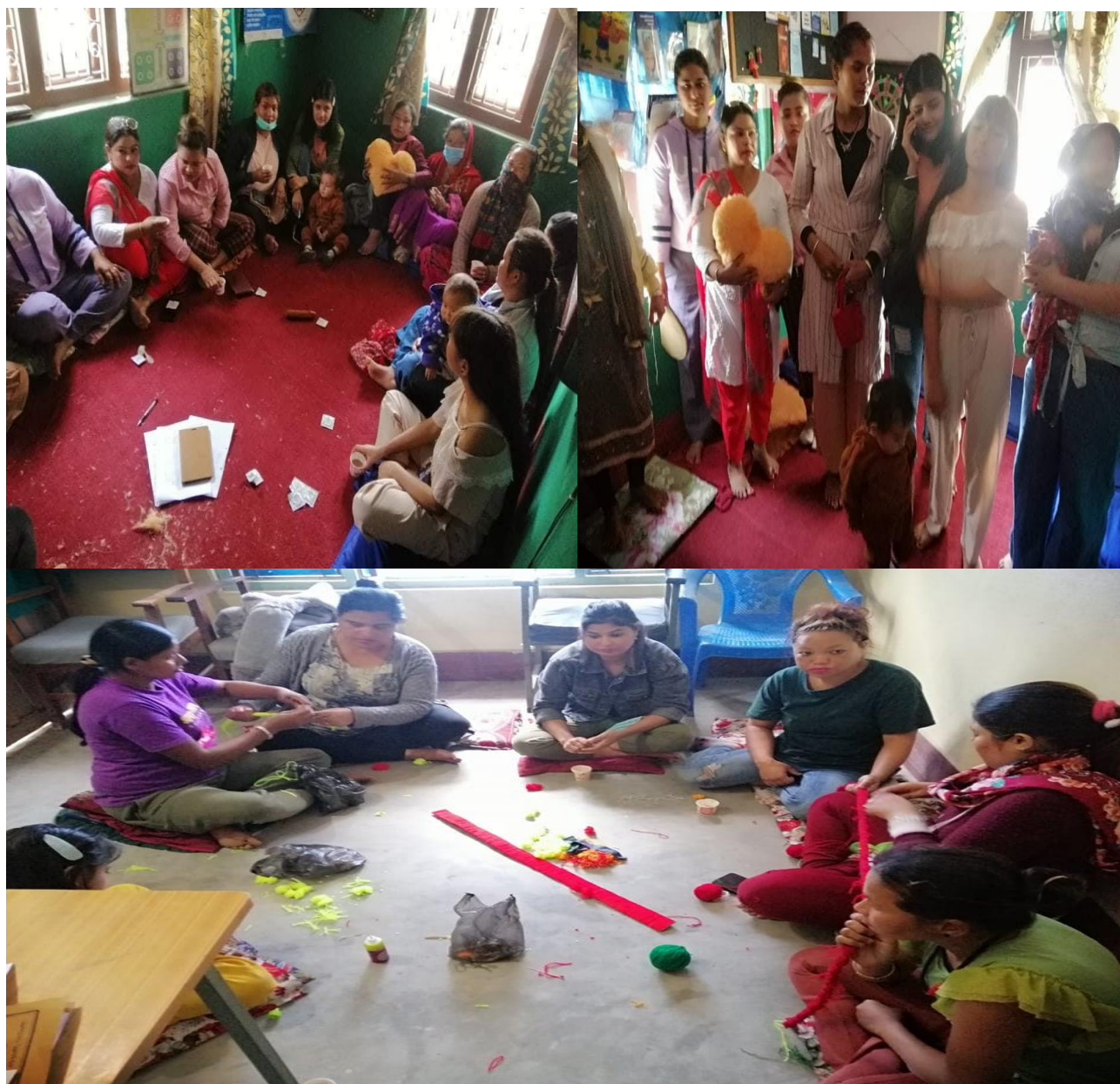
Pic: Creative event conducting in the DIC of Morang and Sunsari.