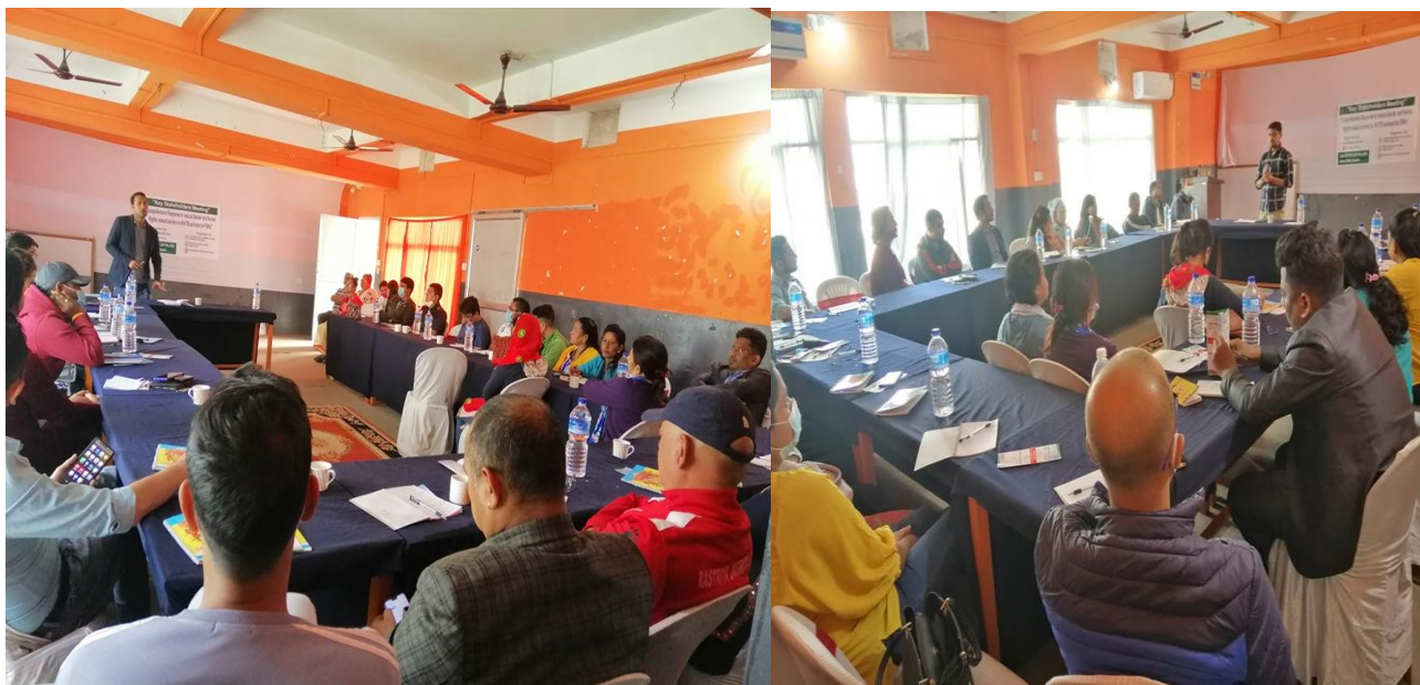
Pic: Sharing of Epic Nepal activities during stakeholders meeting of Sunsari organized by Mahila Sahayogi Samuha