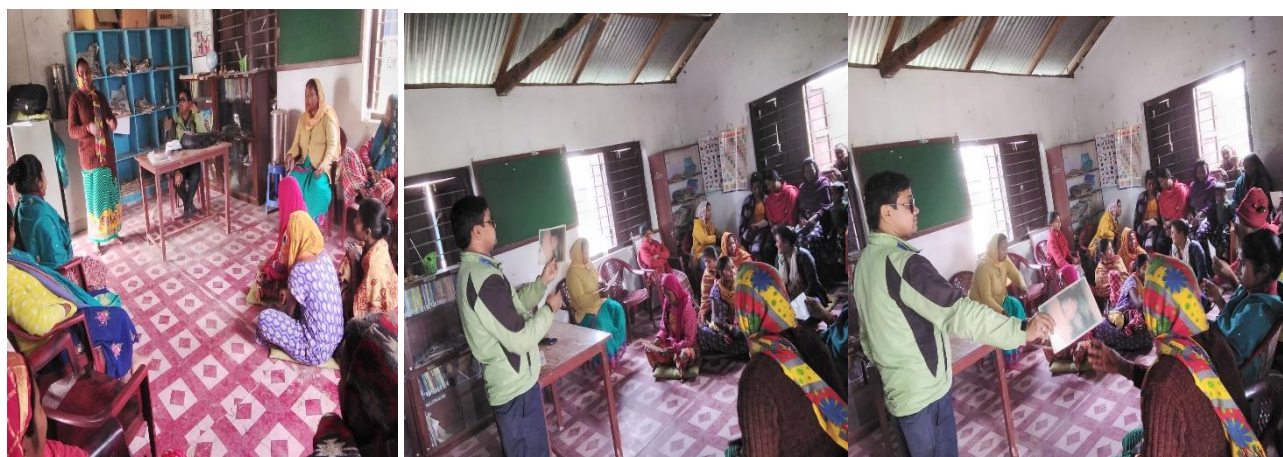
Pic: Stigma and Discrimination reduction training in Jhumka , Sunsari.