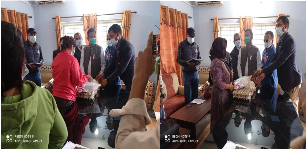
Pics: Nutrition package, Hygiene Kit and Statinary support to PLHIV Members of Itahari