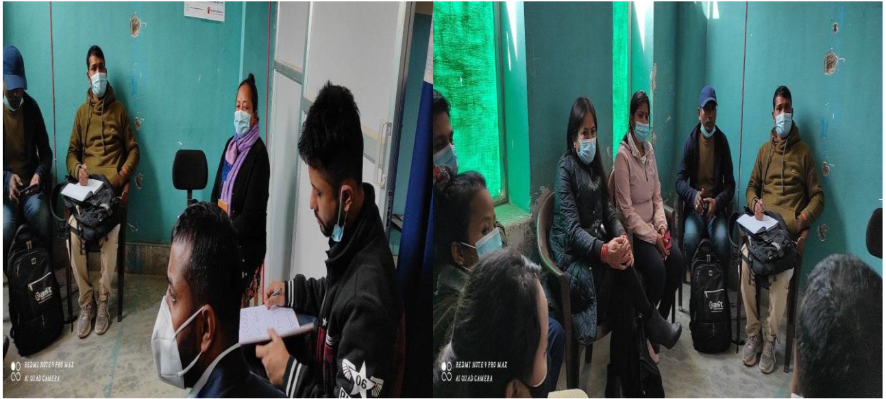
Pics: Conducting Monthly ART Meeting at Inaruwa Hospital, Sunsari.