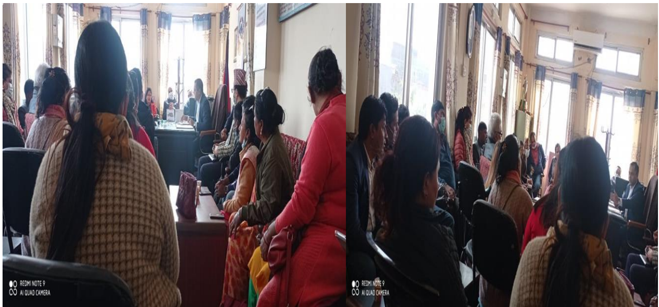
Pics: Coordination meeting at CDO Office Inaruwa, Sunsari with Developing Partners