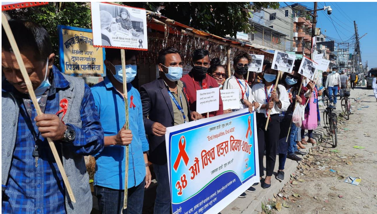
Pics: Informative display cards at Mukti chowk, Birtamod