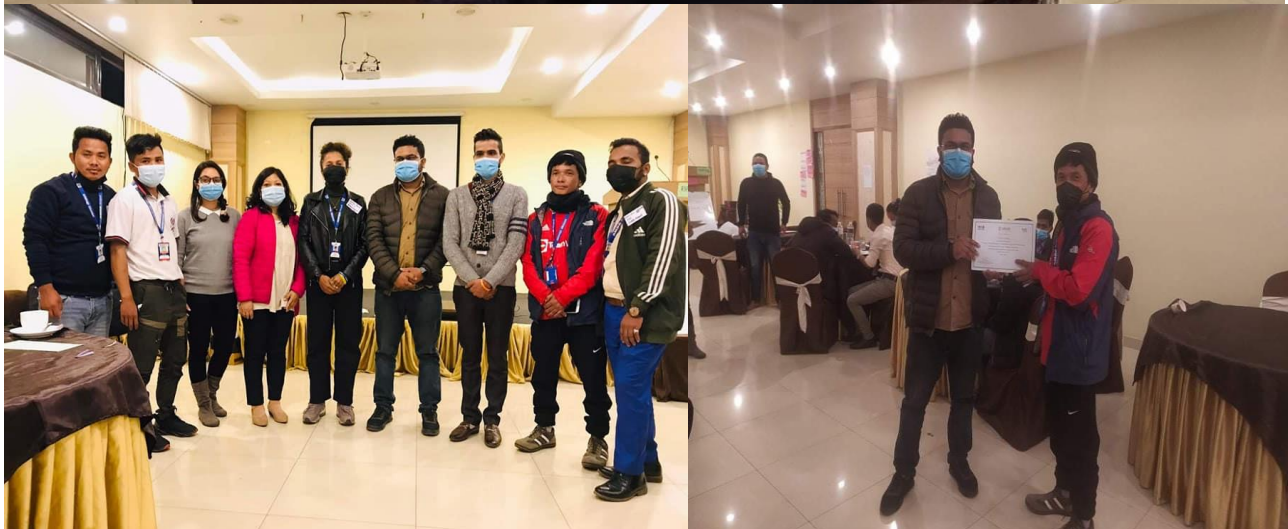
Pic: Training on Motivational Interviewing, Itahari