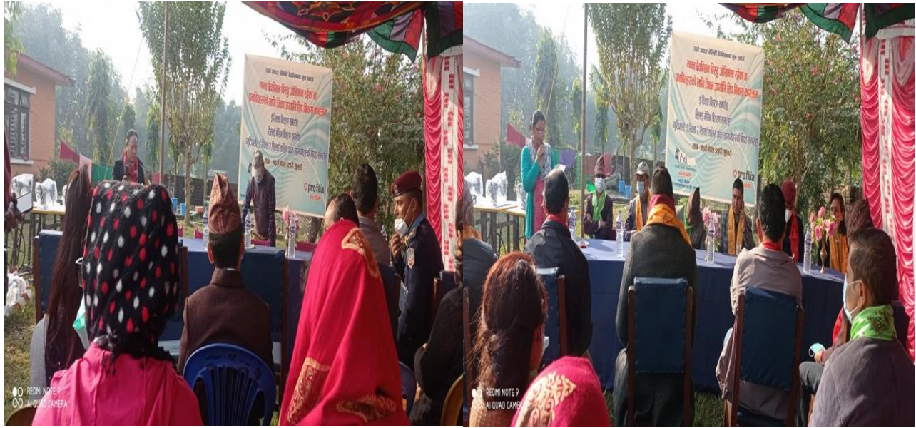
Pics: Participated in program organized by Maiti Nepal Itahari, Sunsari