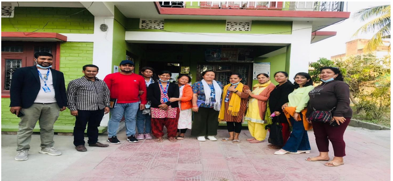
Pics: Group photo after coordination meeting with Shrijanshil Mahila Samuha at AMDA City Clinic, Sunsari