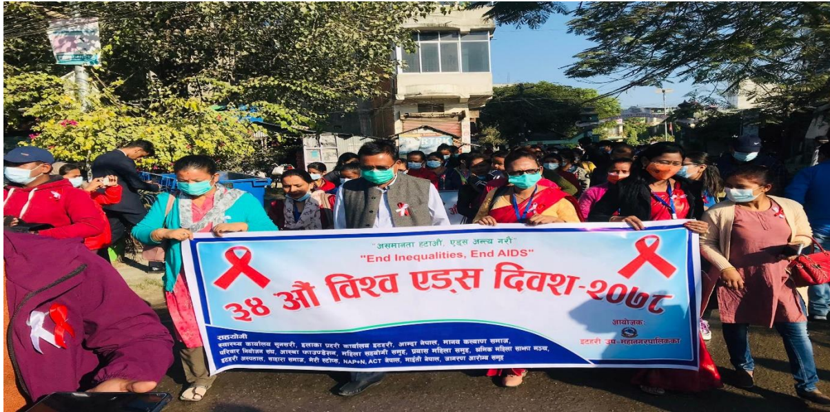
Pic: Nagar Parikrama rally with Mayor of Itahari Sub- Metropolitan city.