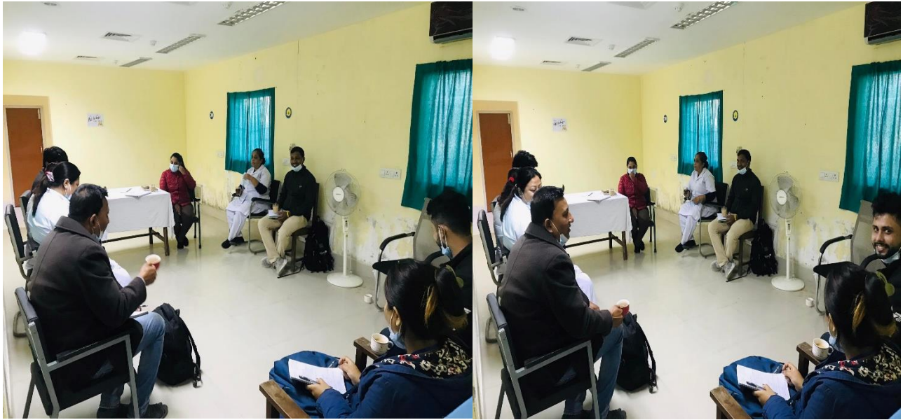
Pics: Monthly ART meeting in BPKIHS, Dharan