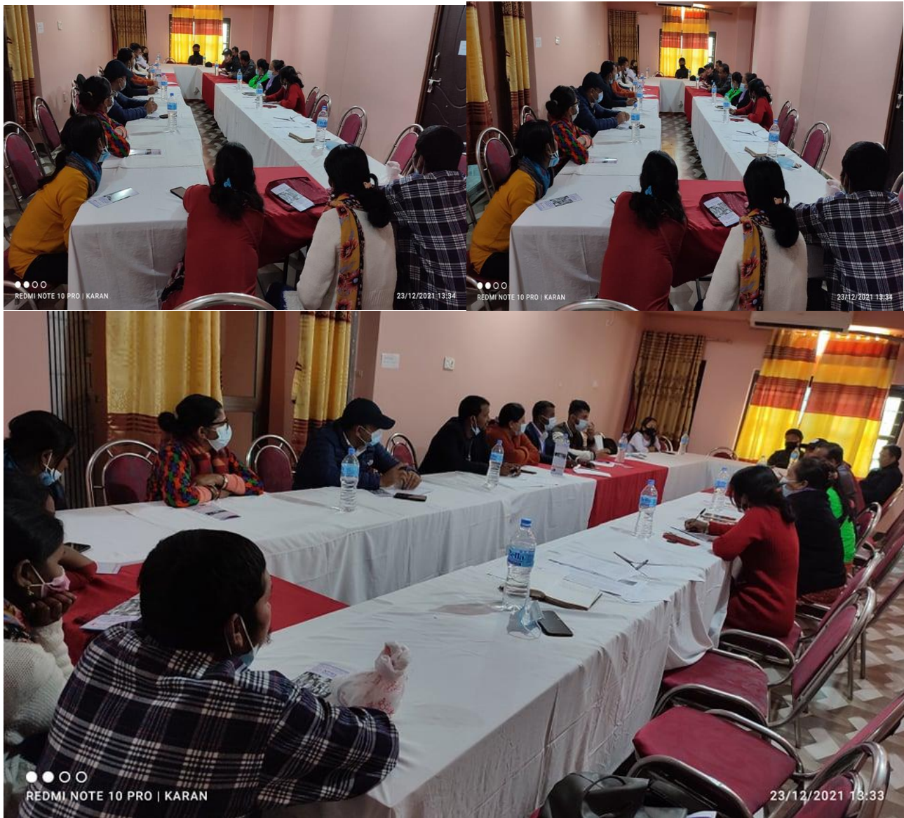
Pics: Participated in the coordination meeting organized by Prayash Mahila Samuha Itahari, Sunsari