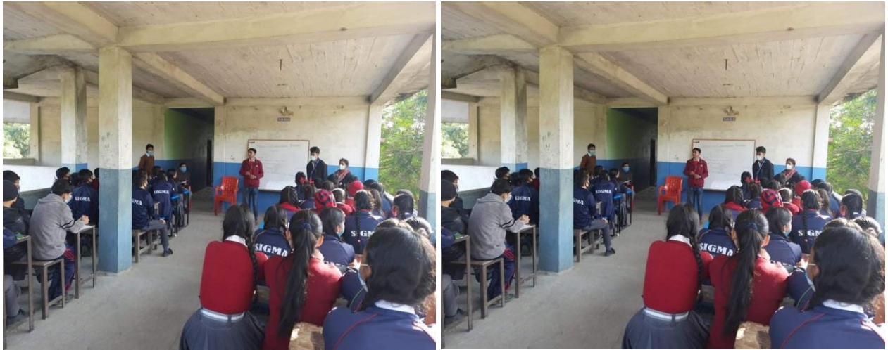
Pic: Conducted S&D reduction training in Parakhopi, Jhapa.