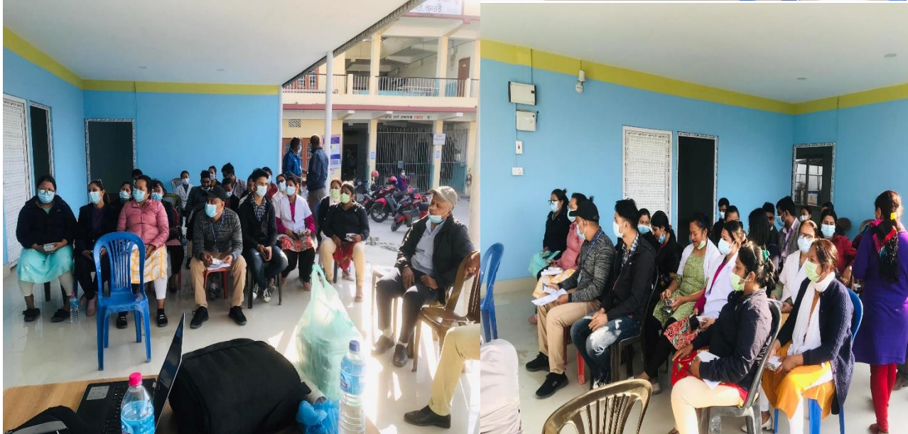
Pics: Conducted S&D reduction training to Health Workers at Itahari Hospital, Sunsari