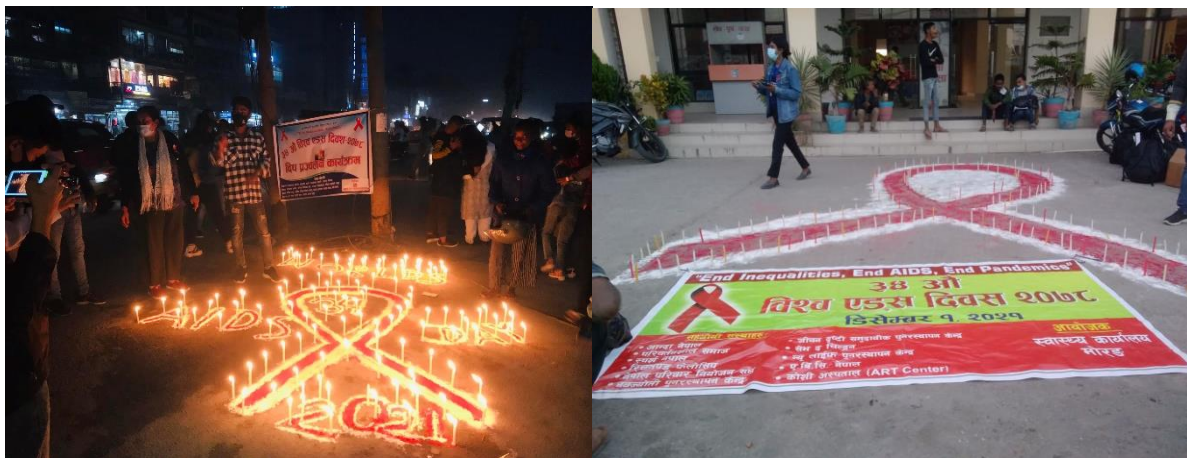
Pic: Candle light Ceremony