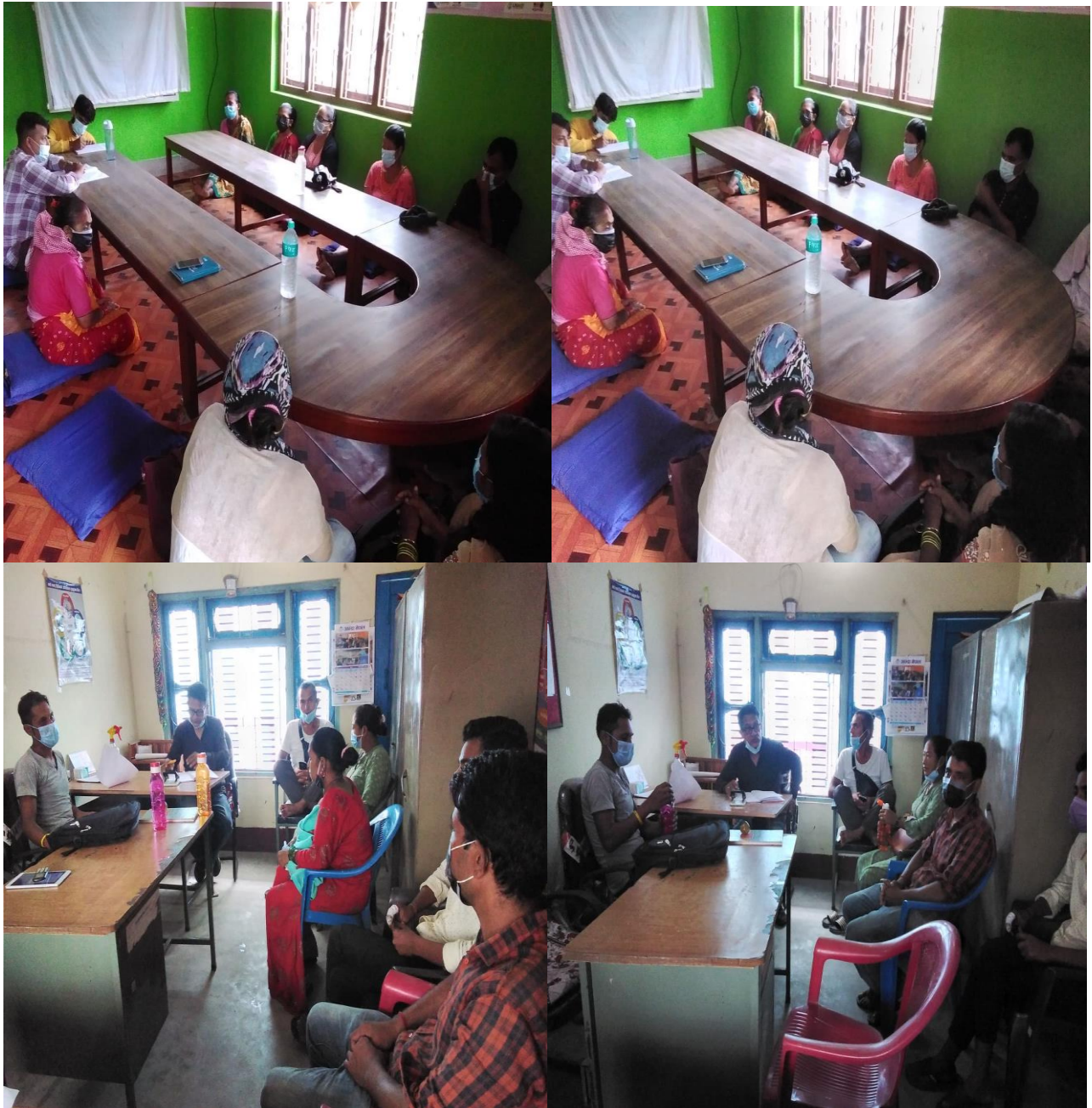
Pics: Conducting Support Group Meeting