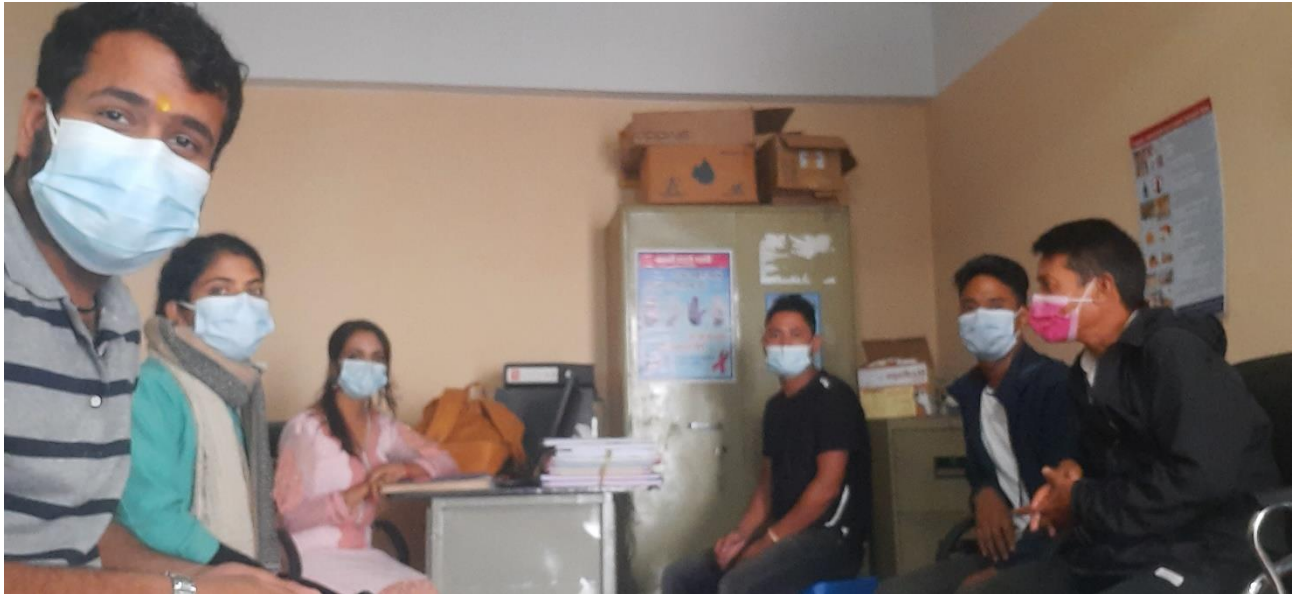
Pic: Monthly ART center meeting in Illam District Hospital.