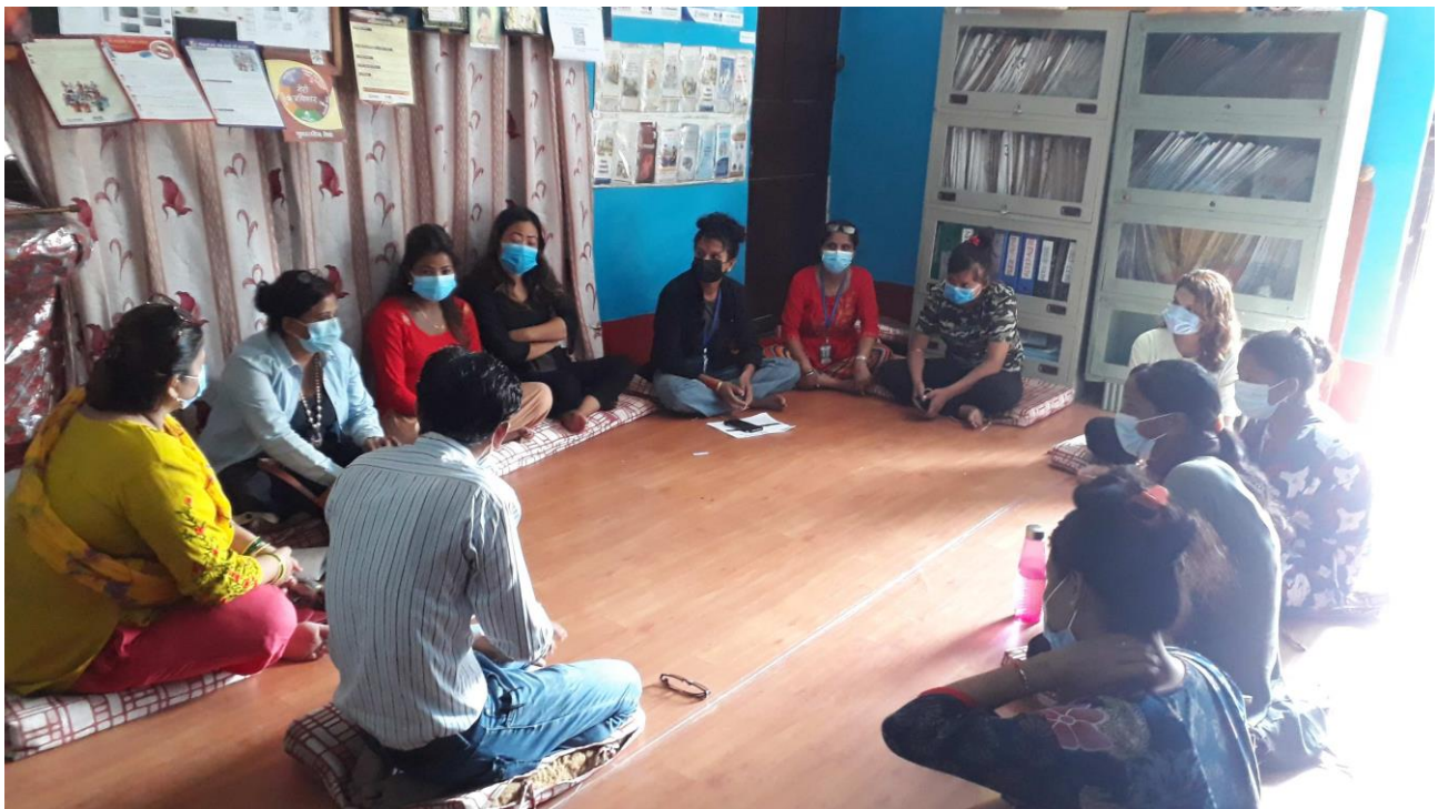
Pic: Creative event, Birtamode city clinic.