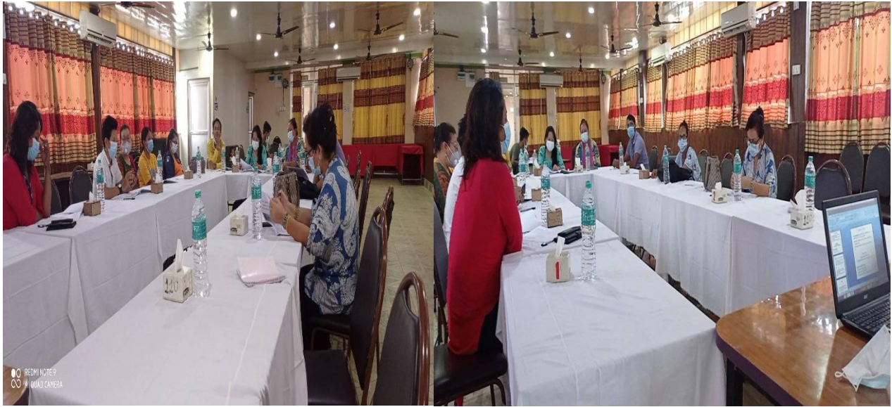
Pics: Coordination and sharing meeting with Prayash Mahila Samuha, Sunsari