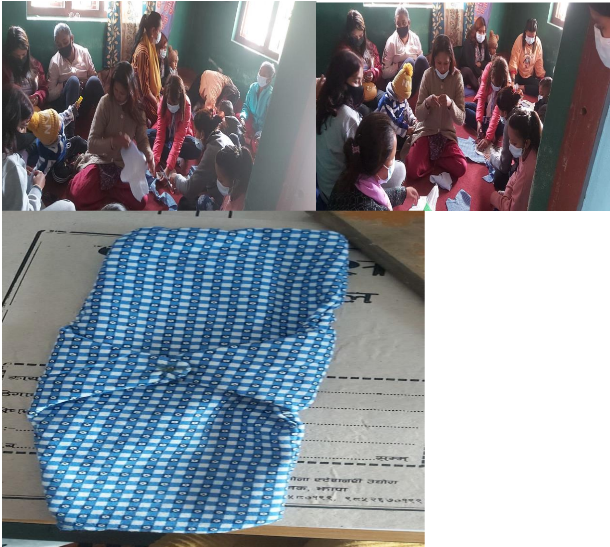
Pics: Creative event in Itahari City Clinic making of reusable sanitary Pad.