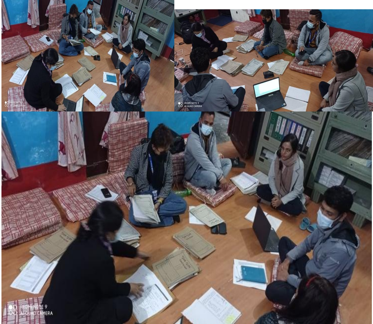
Pics: Conducting DQA in Birtamod City Clinic, Jhapa for SA2 FY21